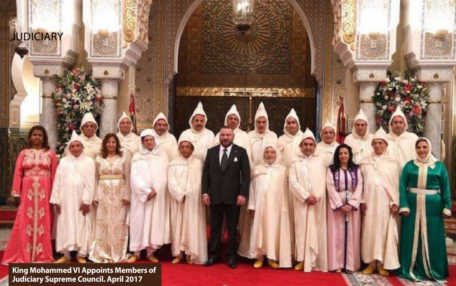
King Mohammed VI Appoints Members of Judiciary Supreme Council. April 2017